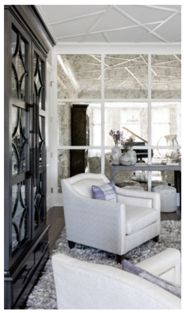
An antiqued, smoked mirror reflects the stunning living room. "The ceiling feature completes the essence of the room," says Wolf.