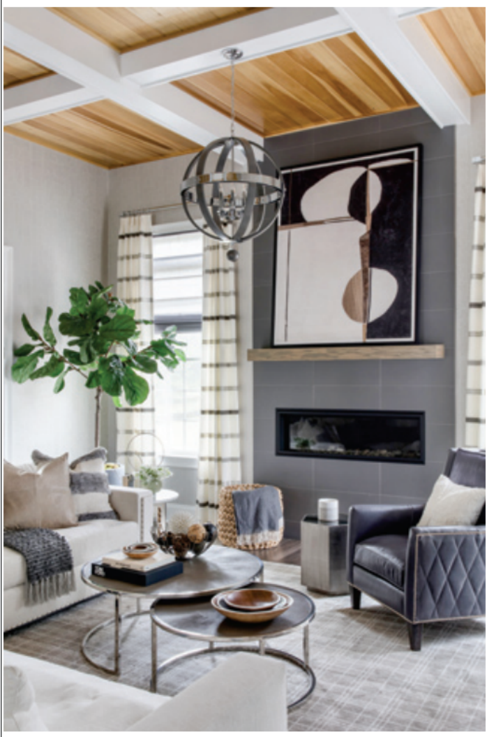
Wolf felt that the high ceiling in the family room was too flat, so she spiced it up with coffers. The wood tones help warm the space. "We added some contrast so that it wasn't a traditional coffer," she says.