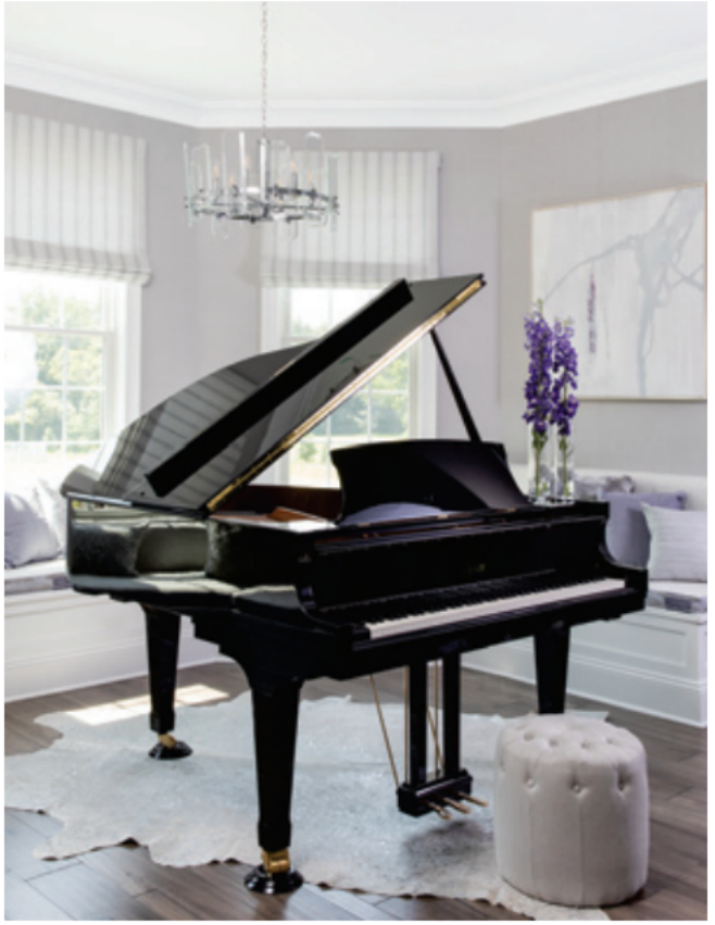
Built-ins behind the piano in the living room offer a convenient space for listening to an impromptu concert.

Wolf. To meet both objectives, the designer was able to combine function with flair, juxtaposing and layering materials for a look she calls "livable luxe."