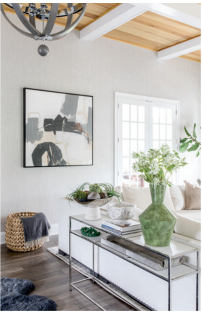
Wolf selected all the art for the house, carefully specifying color and size. "When you rescale art to fill a space, it starts to move from decorative to intentional and looks more informed," she explains.

each half of the room. "We divided the room into two living spaces and centered the light fixtures over each area."