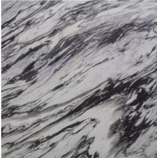
Artistic Tile Calacatta Manhattan Marble ($70 per square foot)

"A brass-plated brushed steel frame is covered in a black leather sling that slips on and off depending on the look you're trying to achieve," Wolf says.