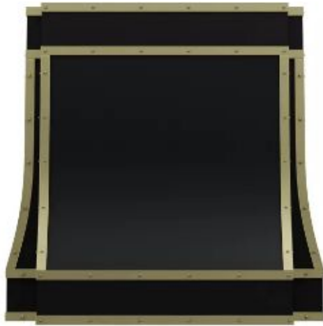
CopperSmith Black Range Hood ($4500)