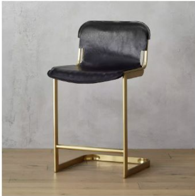
CB2 Rake Brass Counter Stool ($449)

"The hood is edgy and elegant—like the vibe of the kitchen, it speaks to luxury," Wolf shares.